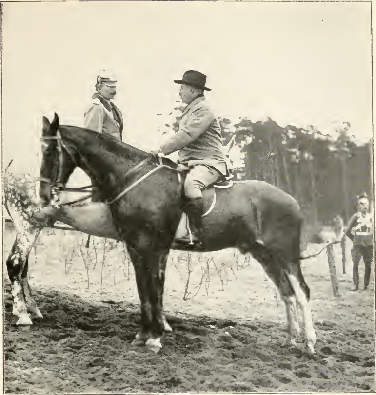
THEODORE ROOSEVELT AND THE KAISER. 1910